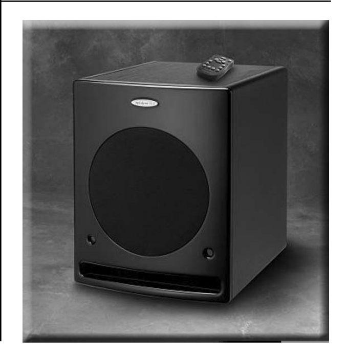
DSP-Controlled Home Theater Subwoofer